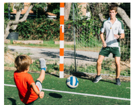
Photos of Sports Day 2018